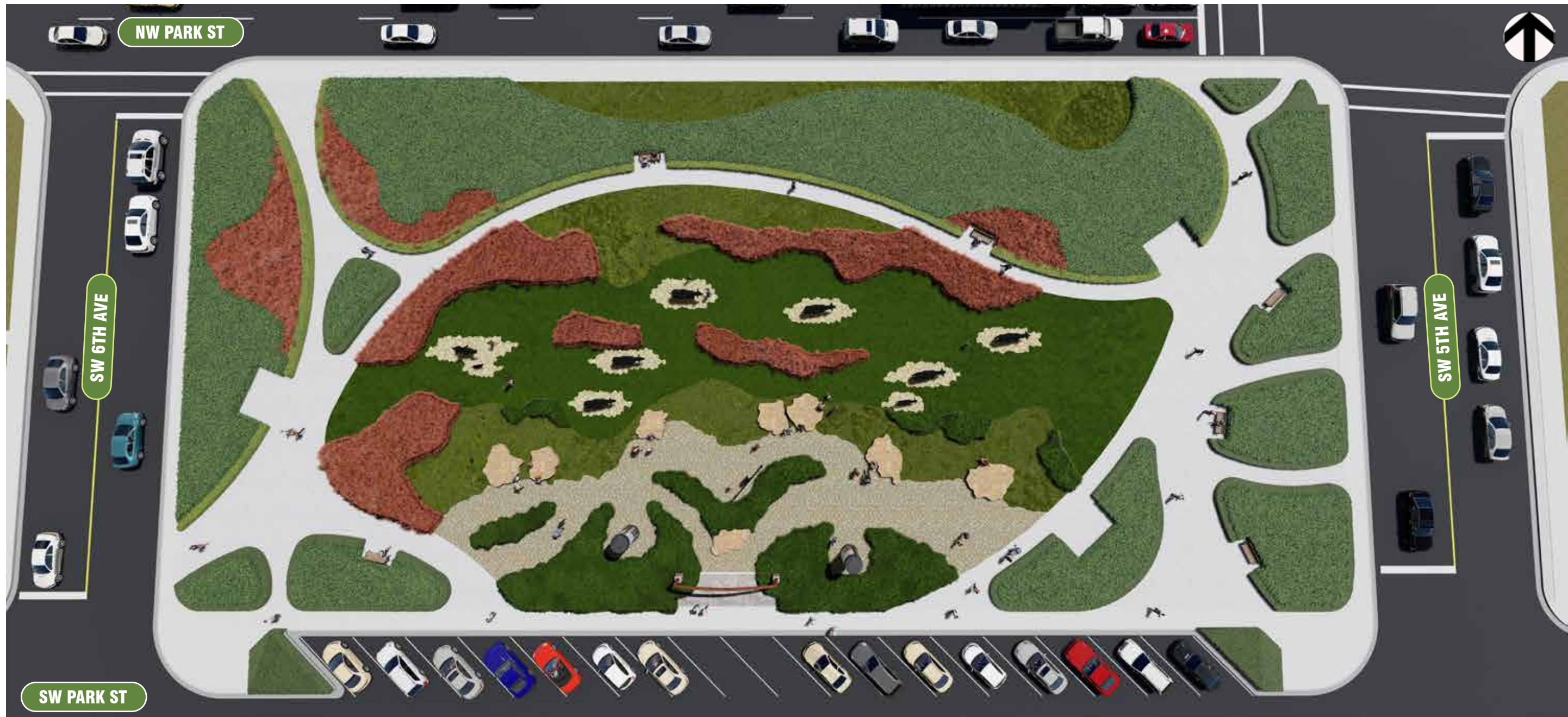
Cattlemen's Park Plan View