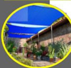
Two Shade Coverings