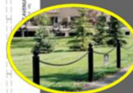
Barriers Around Elements